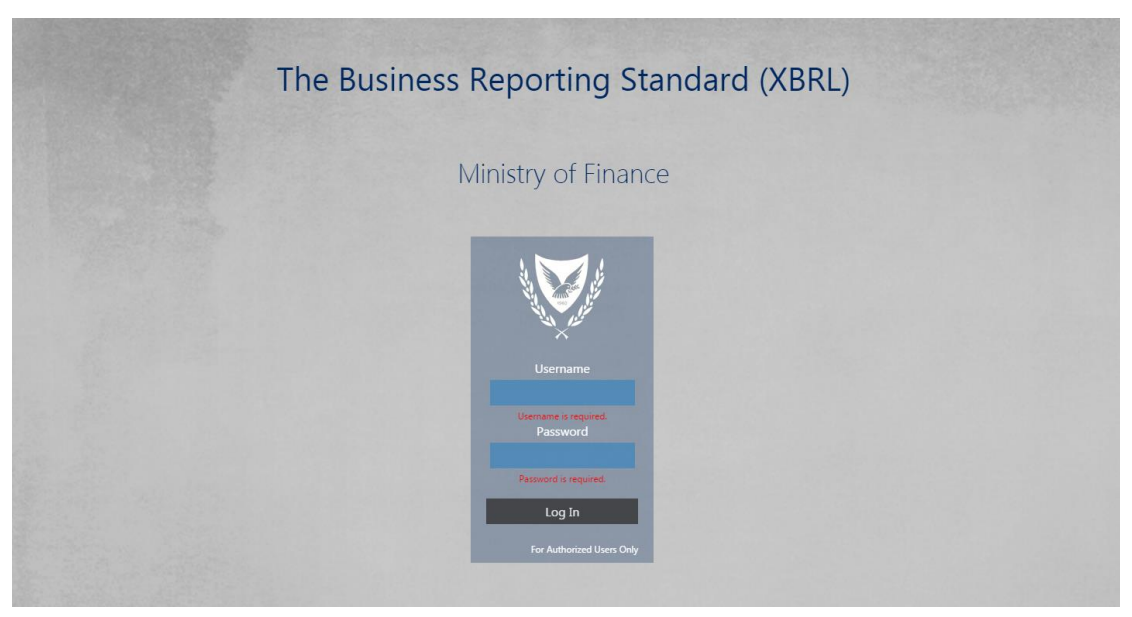
Figure 1-Login Page