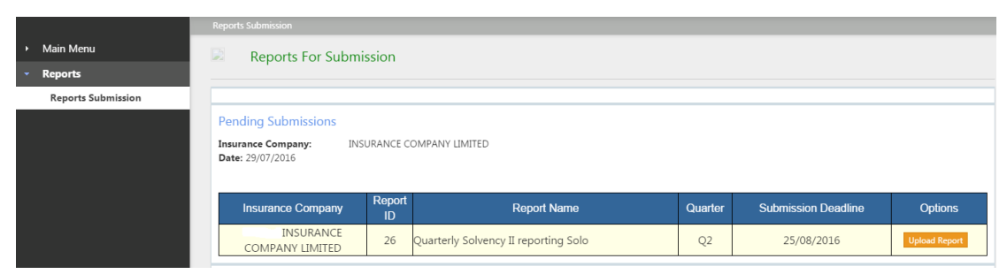
Figure 2-Submission Page

2.3 By selecting <<upl>a popup window appears which allows the undertaking to select the desired XBRL file and proceed with its upload (see figure 3). <a href="Policy Please note that the system">Please note that the system will only accept files in xbrl format.</a>