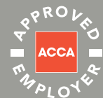
Trainee Development - Platinum